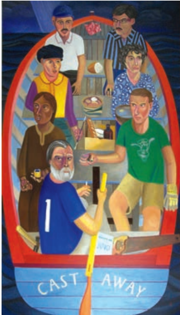
Alan Parker Life Boat oil on canvas (40" x 70.75")