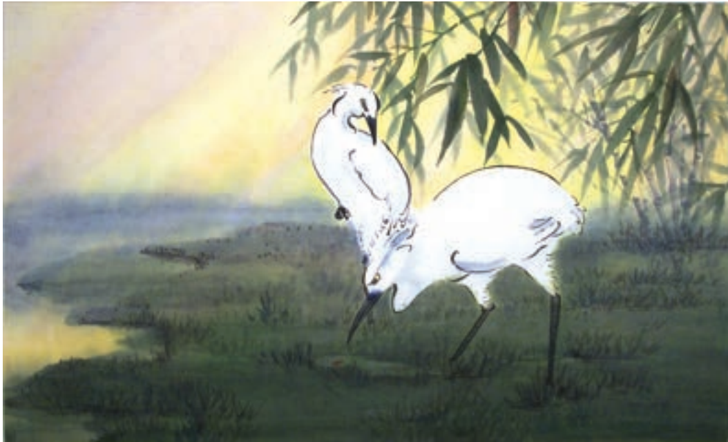
Connie Yee Pure Luck watercolour on paper (20" x 12")