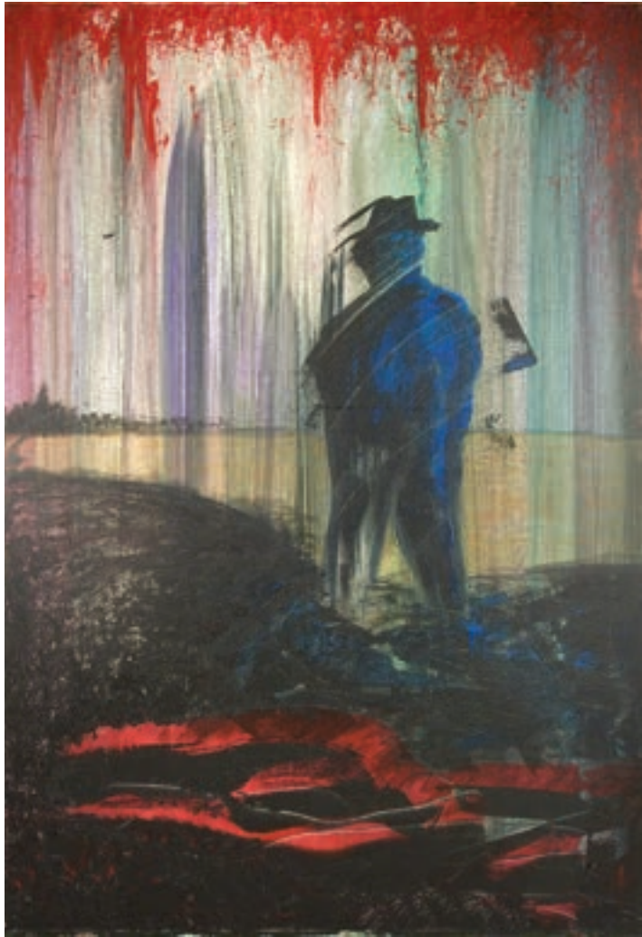
George Warner Only at Night mixed media (24" x 36")