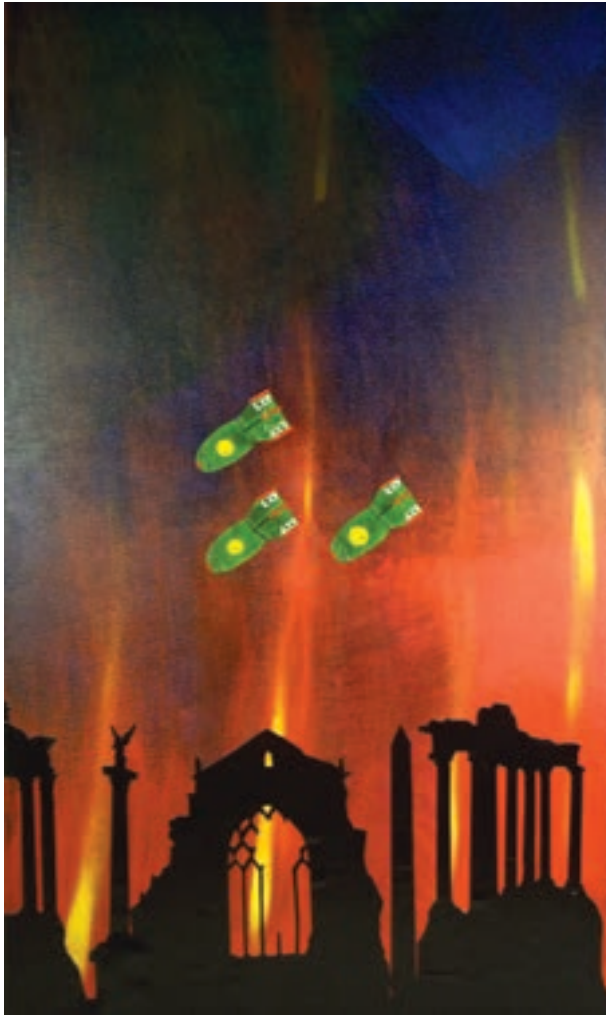
Andrew Zold My Own Private Guernica mixed media (24" x 40")