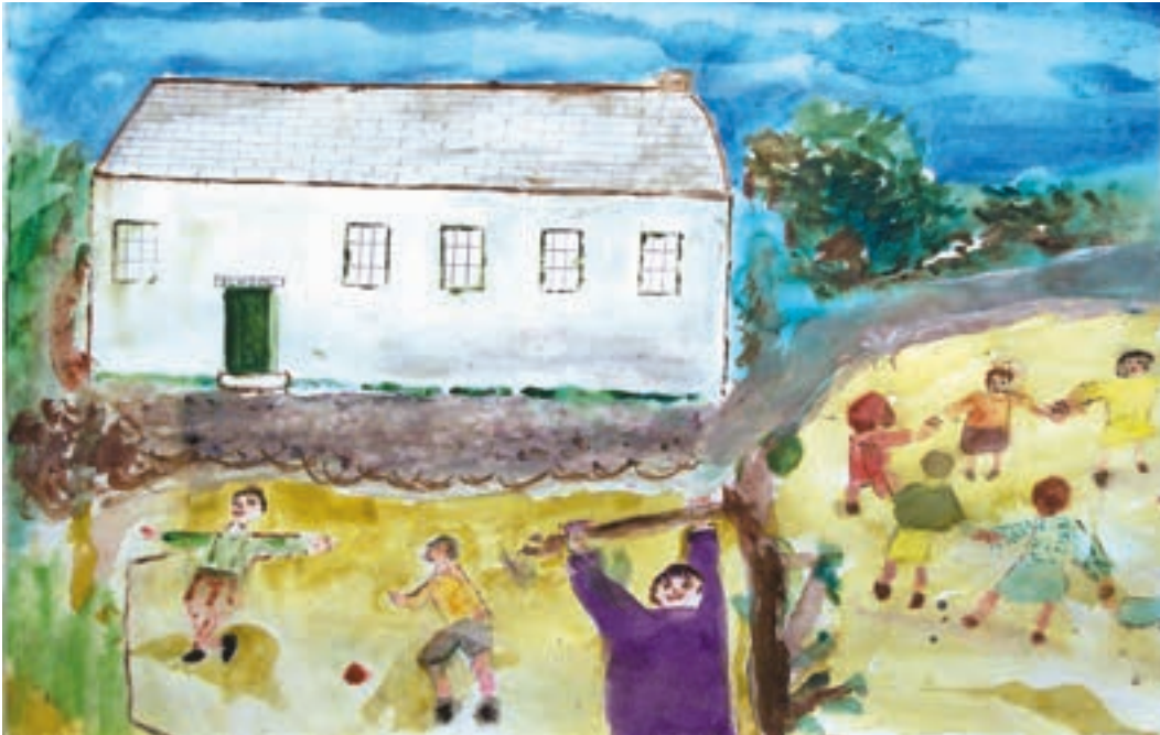
Alice Goldman Old School watercolour on paper (18" x 12")