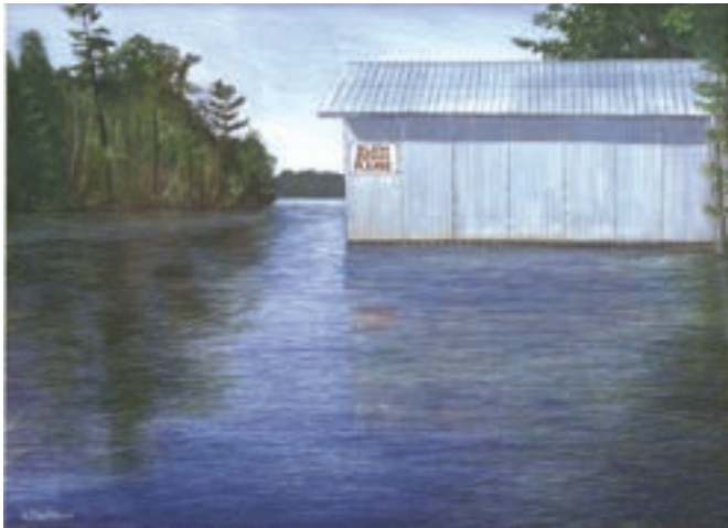
LAVEH River watercolour on paper (25.5" x 21.5") Ann Davidson Slow Down Please, Bellows Bay gouache on board (12" x 9")