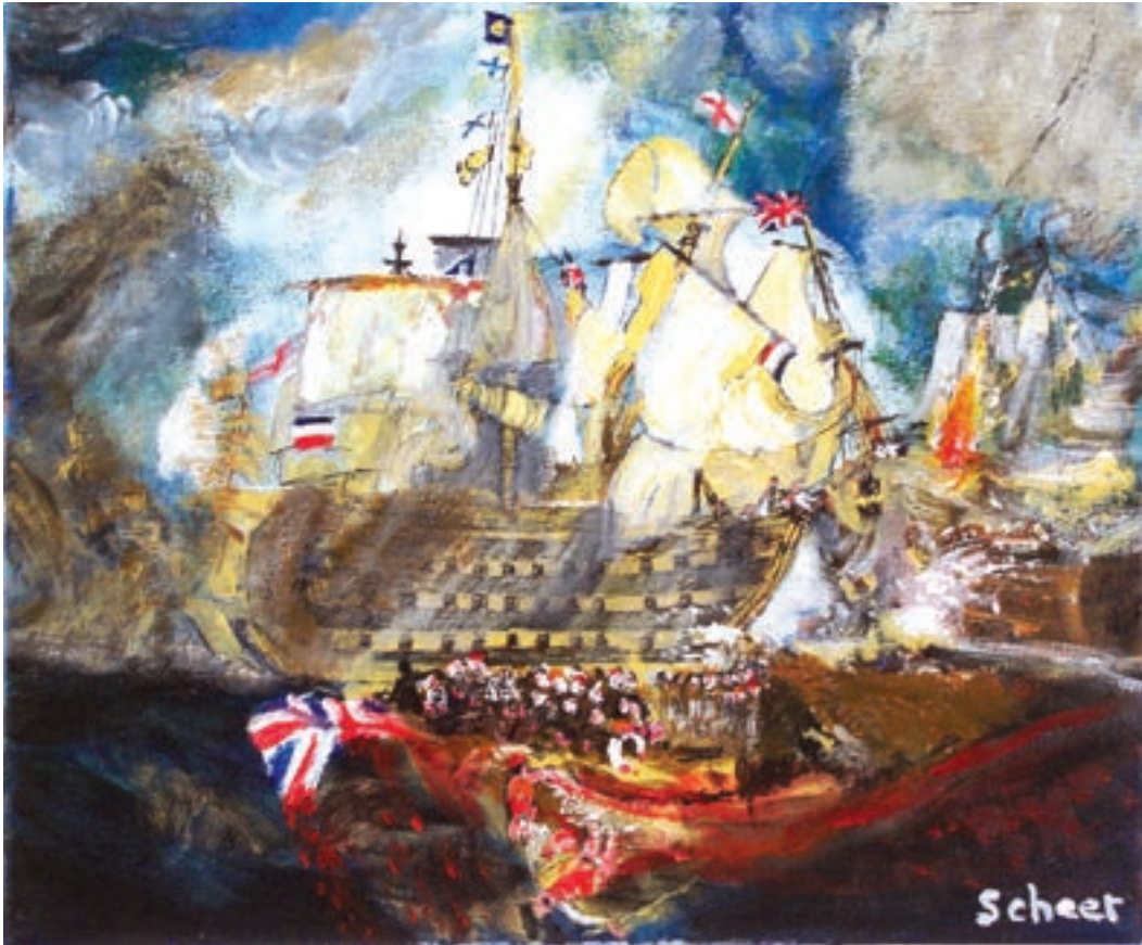
John Scheer Battle of Trafalgar acrylic on canvas (12" x 10")