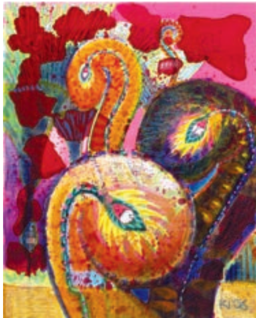
Konstantin Nikov Composition 2 mixed media (11" x 14")