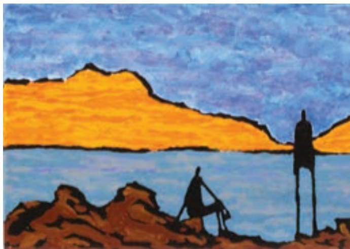
Jan Swinburne Heat acrylic on canvas (7" x 5") Jan Swinburne Grande acrylic on canvas (7" x 5")