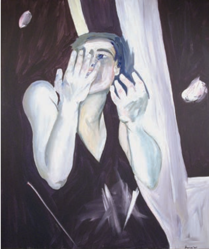
Karine McDonald Untitled acrylic on canvas (30" x 36")