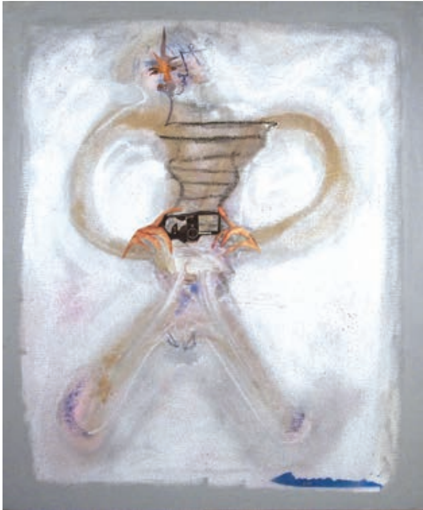
Henry "Banger" Benvenuti Photographer mixed media (25" x 30")