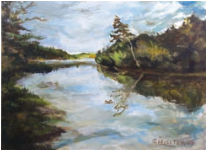
Colleen Levelton Madawaska River View 1 acrylic on canvas (24" x 18")