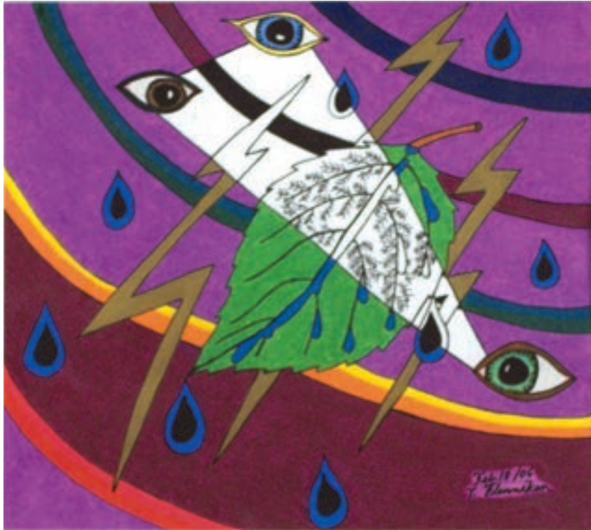
Treese Flenniken Invisible colour pencil on paper (8" x 7.5")