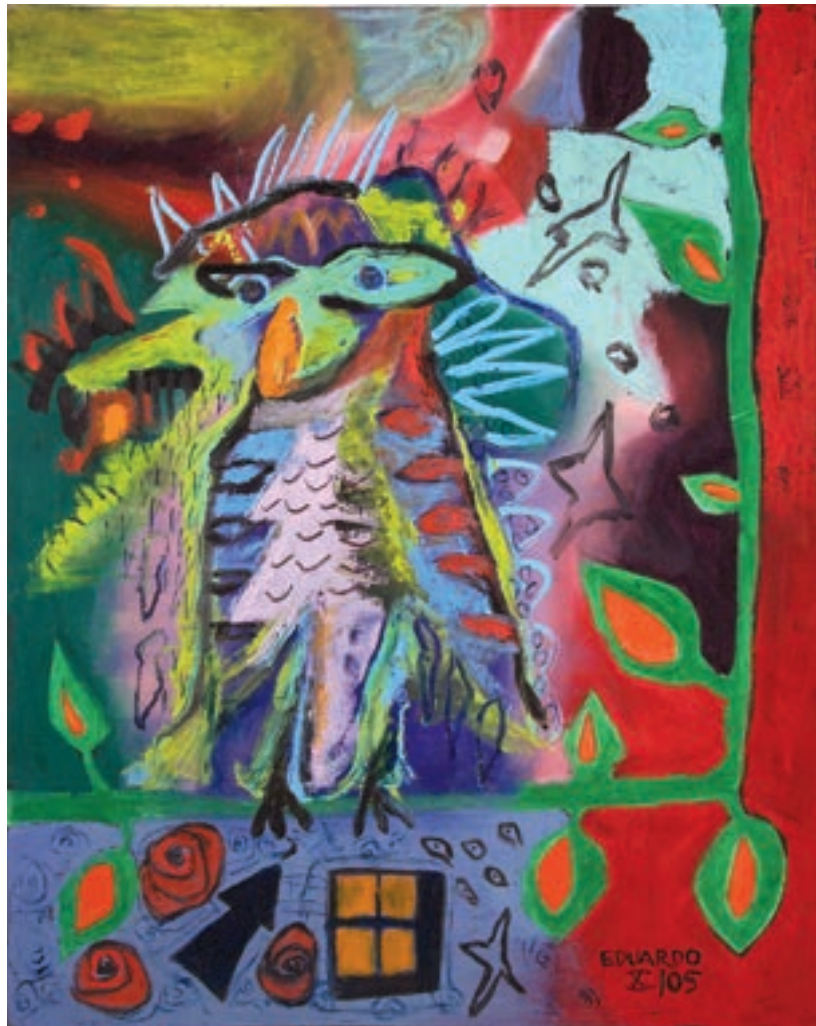
Eduardo Hatch Bird oil on board (24" x 30")