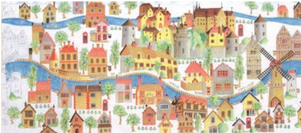
Louise Wiatrowski English Windmill watercolour on paper (24" x 11")