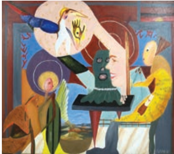
Danae Chambers Woman with Golden Earrings oil on canvas (16" x 14") Jai Wax The Calm Before the Storm oil on canvas (32" x 28")