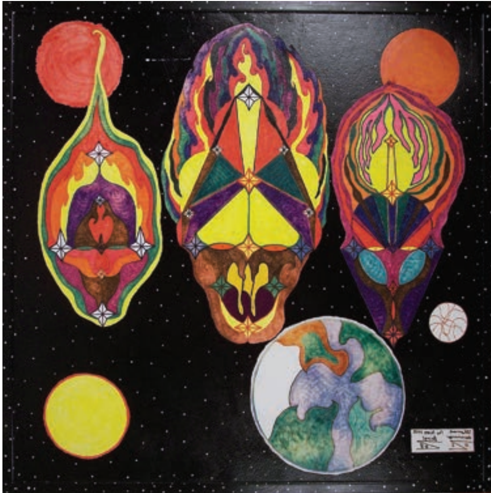
Thomas Canning The Three Wise Beings mixed media (37" x 37")