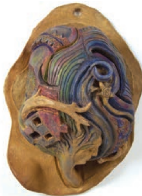
Maria Finta Cargoyles ceramic/wood (3.75" x 14 x 3.5")