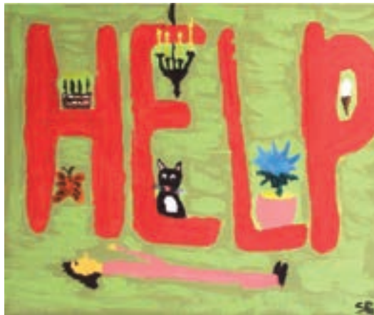
Henry "Banger" Benvenuti Famine with Greed mixed media (14.5" x 21") Sue Goodwin My Favourite Things acrylic on board (12" x 10")