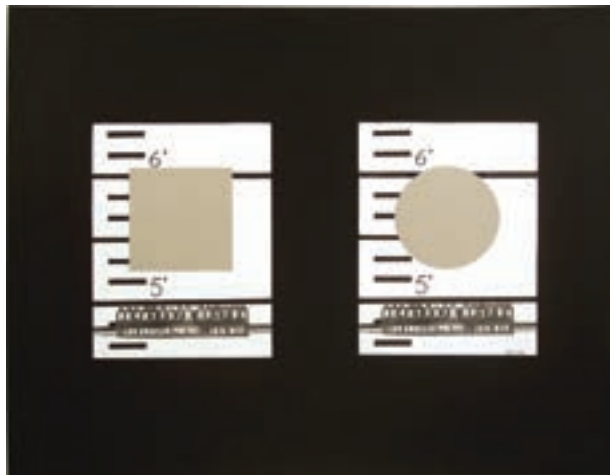
Kent Simard The Rising Moon acrylic on canvas (20" x 16") Jason Hall Square Circle mixed media (28" x 22")