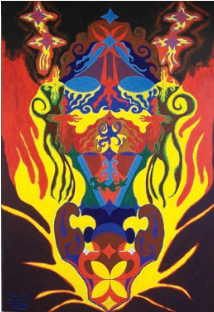
Thomas Canning Star Being One acrylic on canvas (24" x 36")