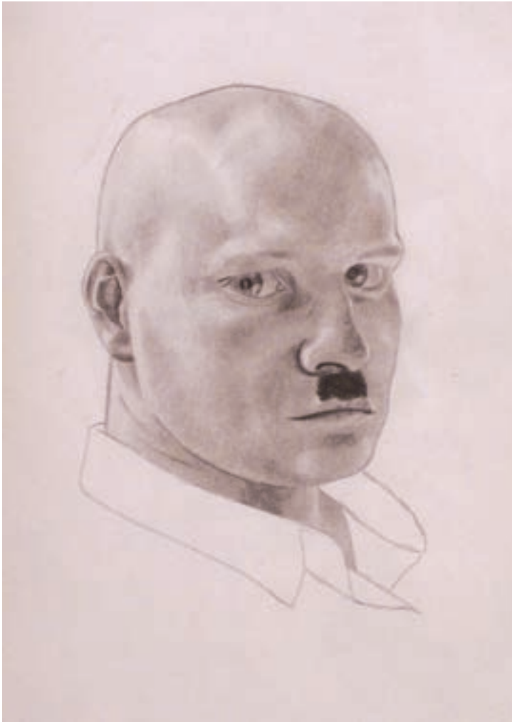
Jason Hall Self-Portrait pencil on paper (8" x 11")