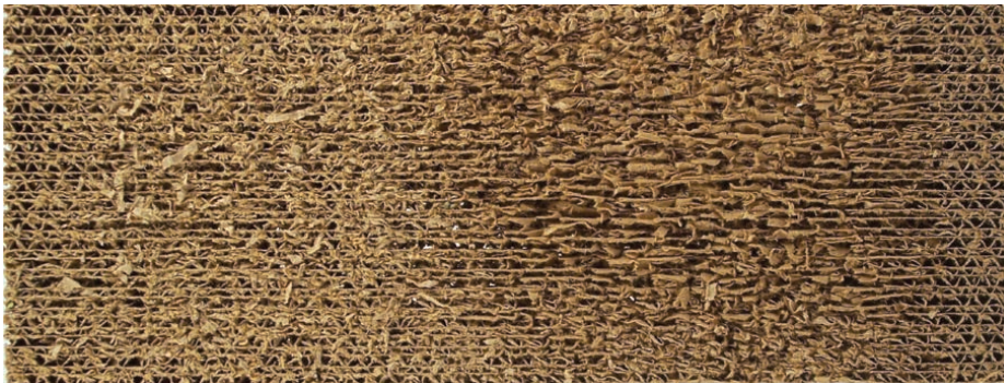
Elysa Martinez Writing mixed media (8" x 8") Douglas Russell Wapp Found Object Sculpture cardboard (7.75" x 19.5")