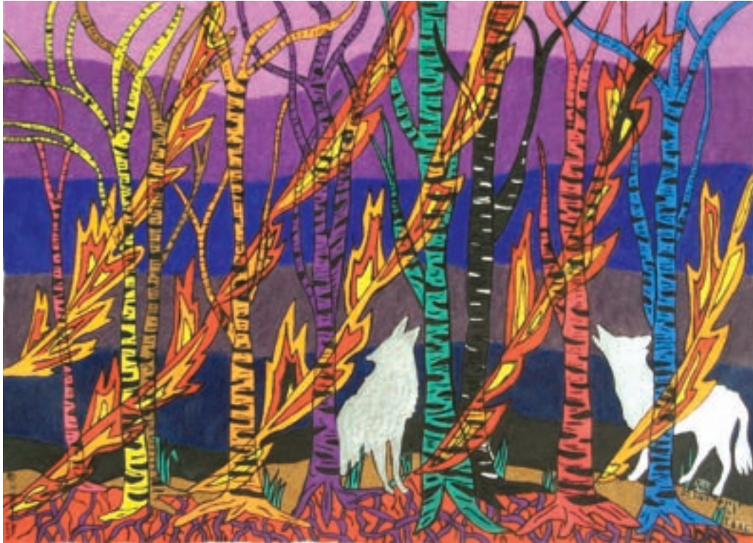
Treese Flenniken The Rage colour pencil on paper (12.5" x 9")