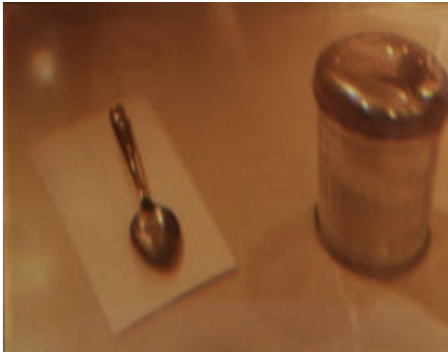
Peter Mulcair Spring Rain photograph (12" x 8") Lavarius Brown Sugar photograph (14" x 11")