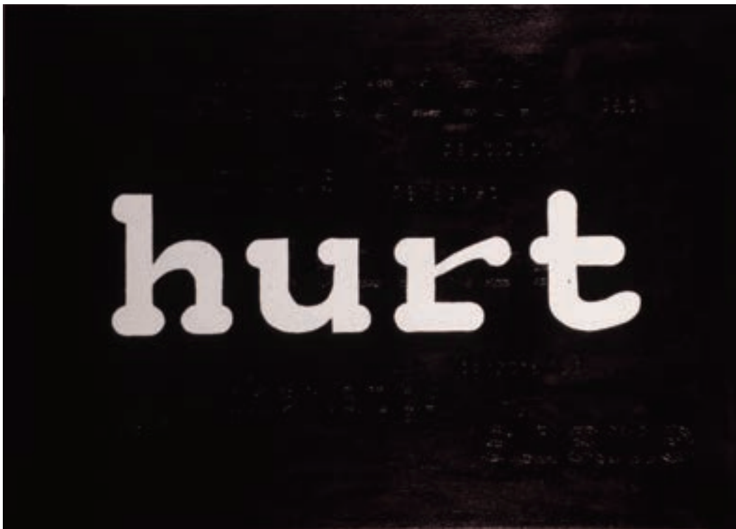
Ashok Soni Inside the Armour acrylic on canvas (42" x 30")