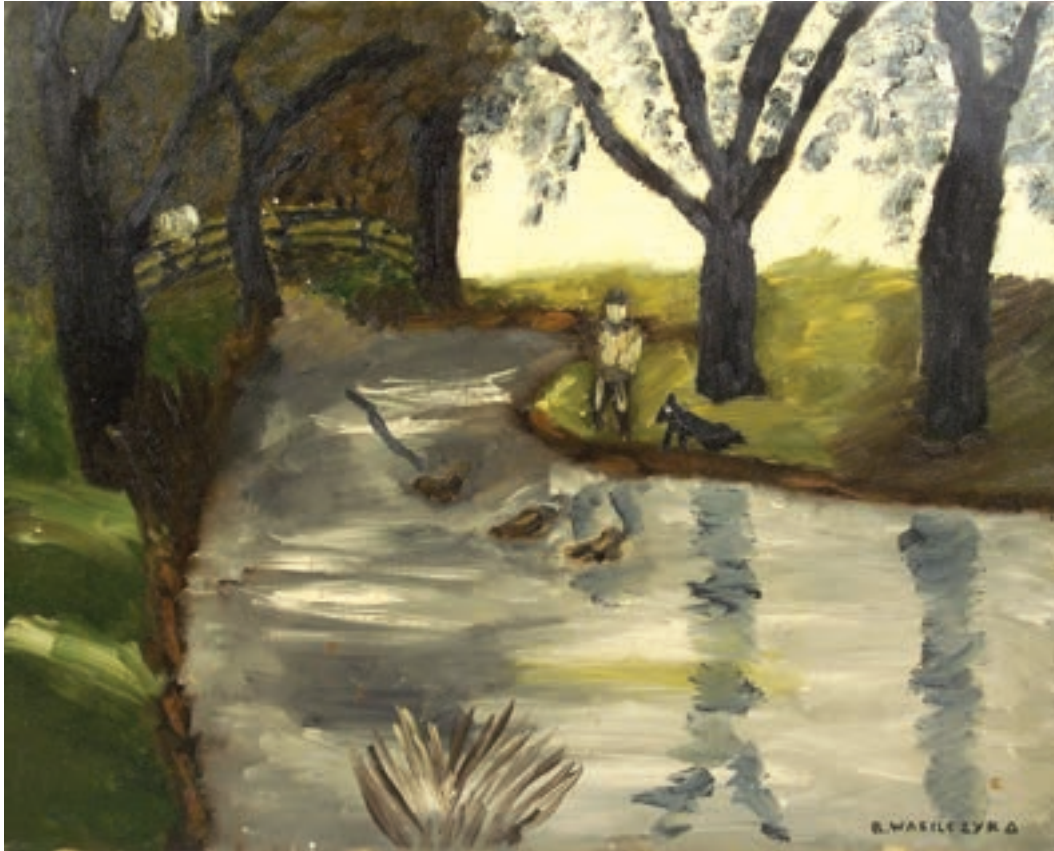
Rai Wasilczyk Reflection oil on canvas (16" x 28")