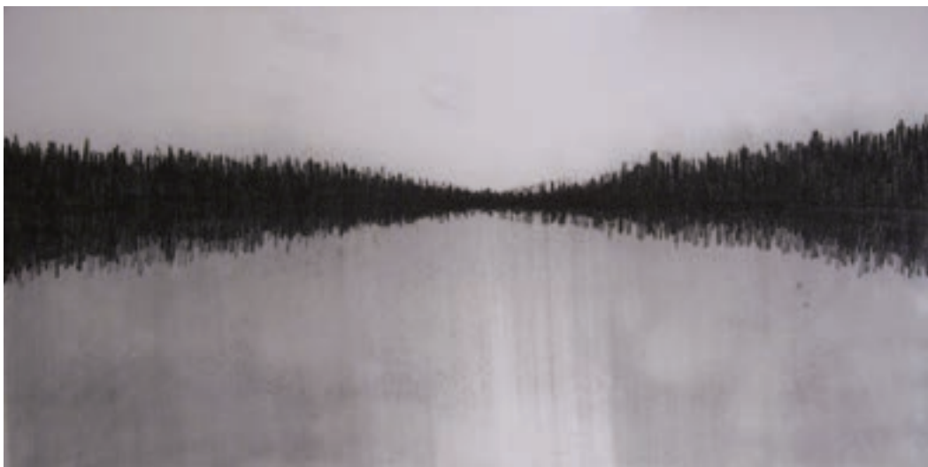
Lavarius The Journey charcoal on canvas (60" x 30")