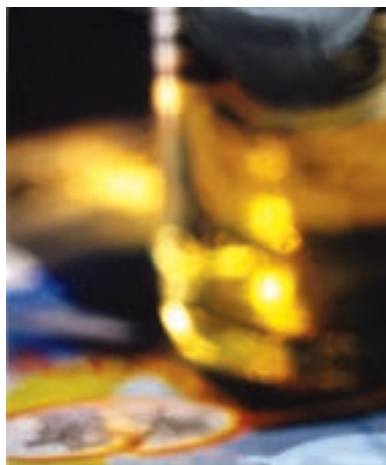
Bradley Hitchcock Watercolour(s) “Upside Down” watercolour on paper (12" x 9") Rishi Vasudeva Untitled photograph (10" x 12")