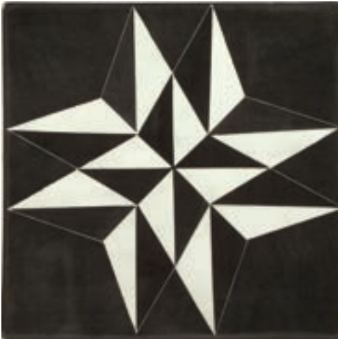
Wendy Lyn Snowdon Anonymous Oxymoron ceramic (6.5" x 9") Glenda Heathcote Tile ceramic (8.5" x 8.5")