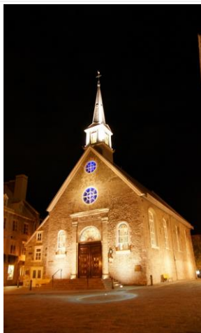
Peter Mulcair The First digital photo 24 x 18"