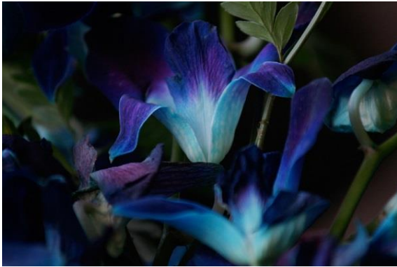
Peter Mulcair Passion Blue , 2008 digital photo 32 x 44"