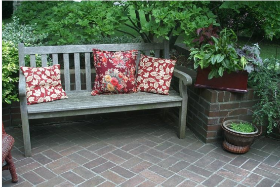
Peter Mulcair In The Garden , 2008 digital photo 32 x 42"