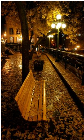
Peter Mulcair Take A Break digital photo 24 x 18"