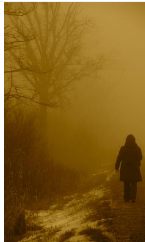
Peter Mulcair Into The Mystic digital photo 24 x 18"