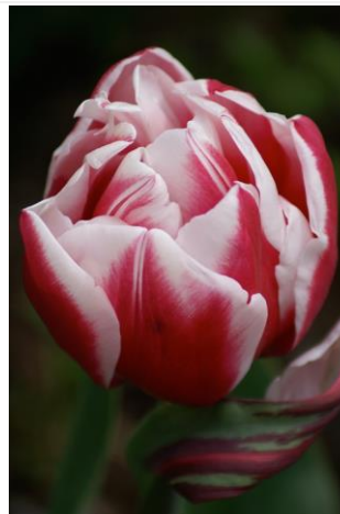
Peter Mulcair Tulip In Spring , 2008 digital photo 44 x 32"