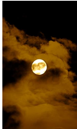
Peter Mulcair Mysterious Moon digital photo 24 x 18"