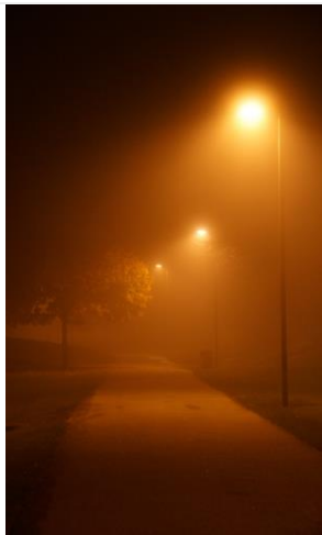
Peter Mulcair The Lonely Walk digital photo 24 x 18"