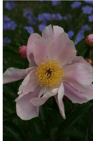
Peter Mulcair Pink And Blue , 2008 digital photo 22 x 30"