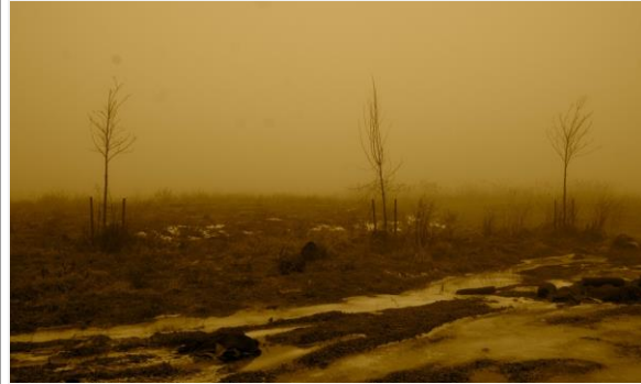
Peter Mulcair The Three digital photo 18 x 24"