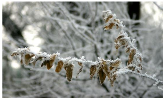
Peter Mulcair Branch Of Frost digital photo 32 x 44"