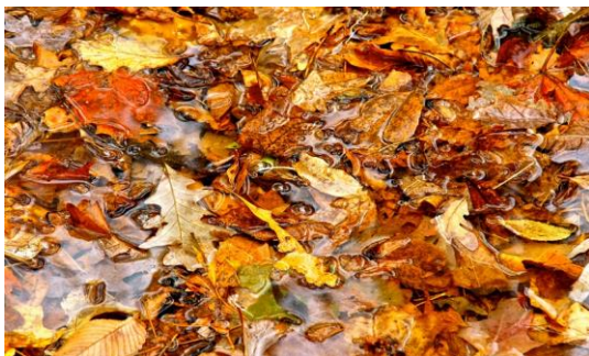
Peter Mulcair Leaves Into Autumn digital photo 32 x 44"