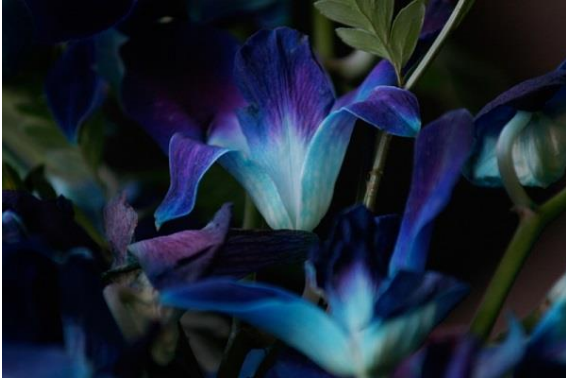
Peter Mulcair Passion Blue , 2008 digital photo 32 x 44"